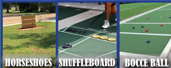
HORSESHOES SHUFFLEBOARD BOCCIE BALL

The Groves features 9 outdoor fitness machines made by Greenfield Exercise Equipment. The equipment consists of machines that develop stamina, upper arms and body, legs and lower body as well as overall conditioning. The machines use your body weight for resistance. The Groves will be a great place to get a workout in while the kids practice. Combine it with our walking trail and meet new people. Sorry, machines are for ages 14 and above. Come try our new equipment!